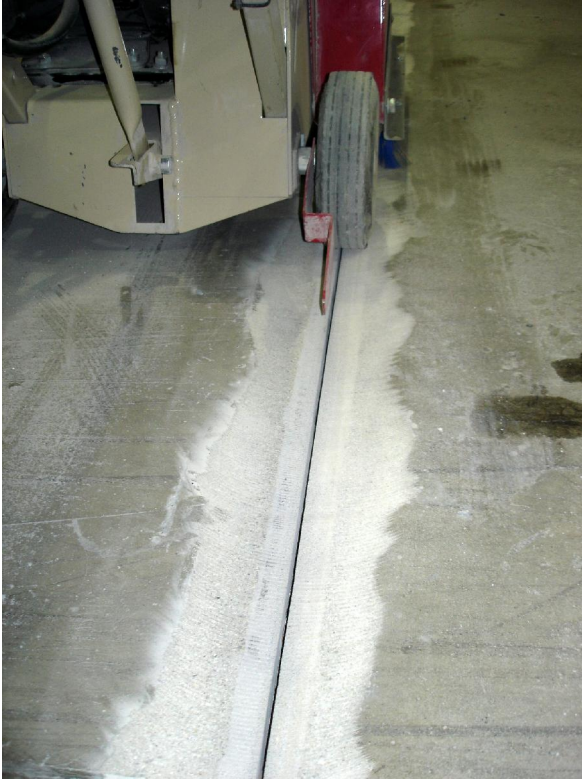
Saw Cut New Joint