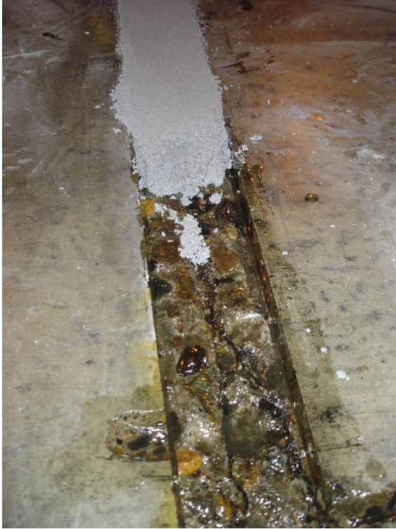
Fill Joint with Armor-Hard Mortar