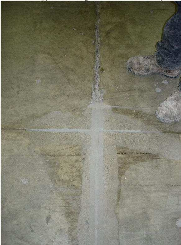
Razor Off Cured Spal-Pro 2000 Overfill