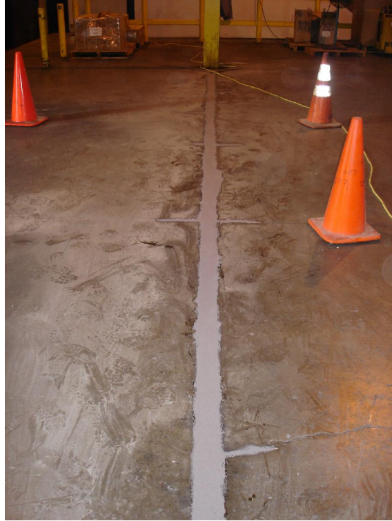
Trowel Mortar Flush with Floor