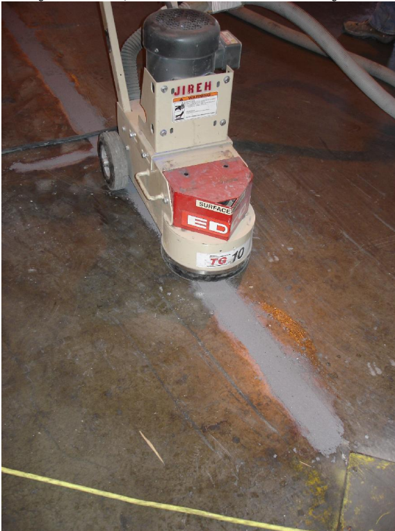
After Cure, Grind Flush with Surface